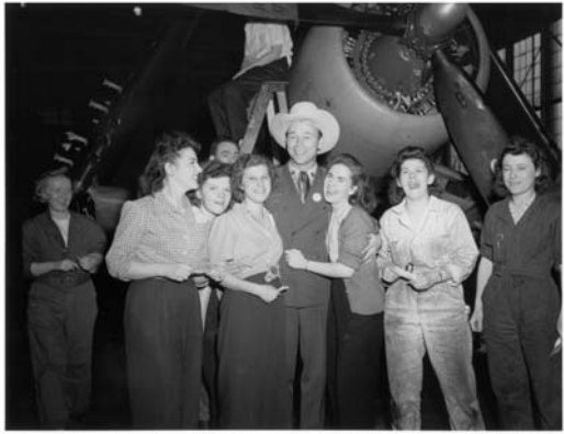
Roy Rogers stops by to boost the moral of the Rosies working on Corsairs at Goodyear Aircraft Company during WWII.