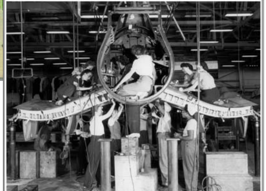
Rosies work on the cockpit section and wing root of a Corsair. One of over 4000 built by Goodyear Aircraft Company during WWII.

MAPS just received a collection of WW II US and RAF aviation flying helmets, goggles, oxygen masks, avionics, etc. from MAPS member Dave Bell. They are currently on display in the new display room. The curators department just finished a display of a USAF Desert Storm female dress uniform, including hat and dress shoes. Very impressive. It's also located in the new display room.