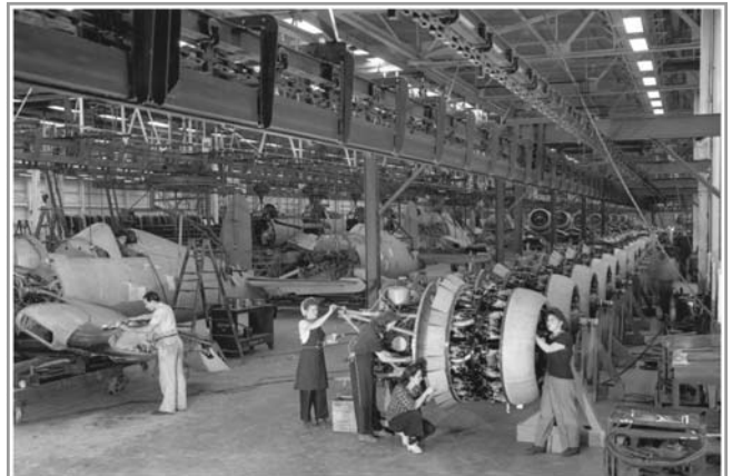
FG-1 Corsair production line. Goodyear Aircraft Company produced more than 4000 of the "Bent-wing Bird" during WWII.