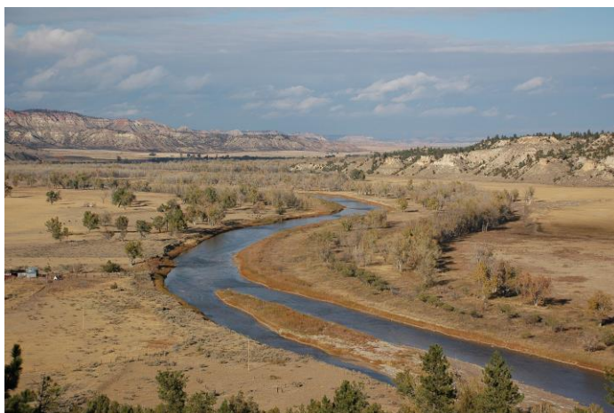
The Powder River looking north on the battlefield