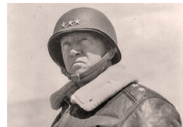
General George S. Patton

To support this deception and to provide German aerial reconnaissance flight with what the allies wanted them to see, the allies created a "Ghost Army". Activated on January 20, 1944, the 23rd Headquarters Special Troops was the first mobile, multimedia, tactical deception unit in US Army history.