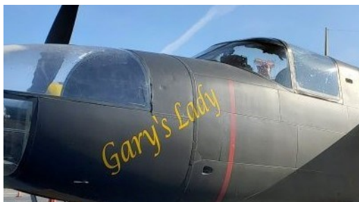
Gary's Lady Before