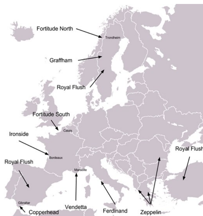
The map above shows the locations of Operations designed to deceive the Germans.

Operation GRAFFHAM was intended to imply that the Allies were building political ties with neutral Sweden in preparation for an upcoming invasion of Norway.