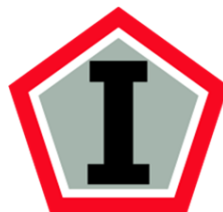
Patch of the fictitious 1st U.S. Army Group

being prepared to invade the Pas-de-Calais after an initial diversionary invasion in the Normandy area. To support this deception, Patton remained stationed in England until 6 July, thus continuing to deceive the Germans into believing a second attack would take place at Calais.