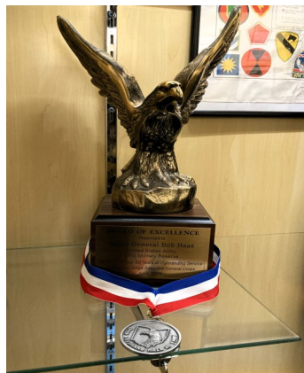
Ohio Veteran's Hall of Fame Award - 2008