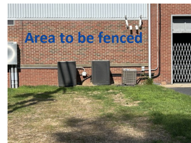
Area to be fenced