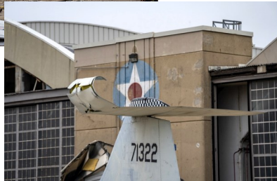
Wright-Patterson AFB photos