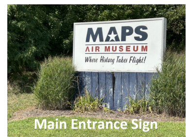
Main Entrance Sign