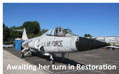
Awaiting her turn in Restoration