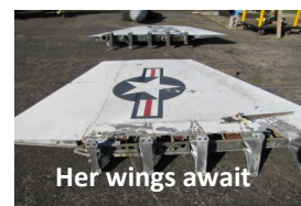
Her wings await

See next page to learn about the F-104D and what our plane might look like when she is restored.