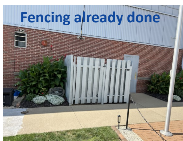
Fencing already done