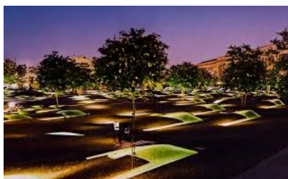
The Pentagon Memorial