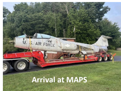
Arrival at MAPS

On August 8, 2024 at 6 AM, Jim Jackson, Denny Bachtel, Bill Barracato and Chet Starn set off for Dayton to bring our plane home. They started disassembling the plane at 10 AM and were off the base by 2:30 PM. A very busy 4 1/2 hours! The wings were already off, they removed the nose cone and cut off the damaged and curled end of the horizontal stabilizer. The fuselage was then loaded onto the flatbed and the removed parts of the plane were loaded on a separate trailer. As they made their way down the highway, you can imagine the looks from other drivers! The crew and plane arrived safely back at MAPS at 8 PM.