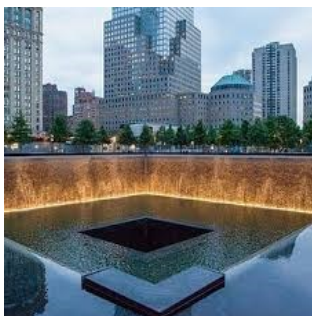
National 9/11 Memorial