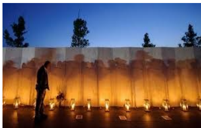
Flight 93 National Memorial