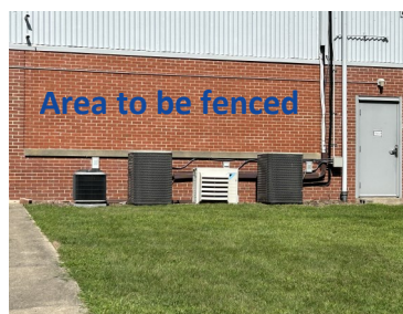
Area to be fenced