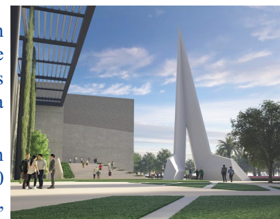
National POW/MIA Memorial and Museum