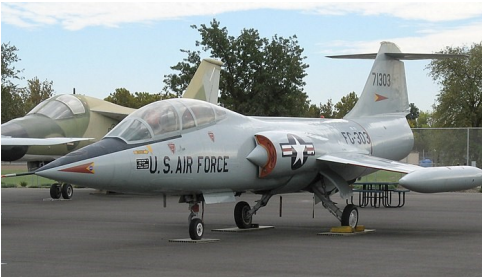
F-104D on static display at Sacramento Aerospace Museum in CA

The F-104 had a wingspan of only 21 feet 11 inches and a length of 54 feet 9 inches. Its normal top speed was about Mach 2.1 (about 1,550 miles per hour) at 35,000 feet. In special efforts the F-104 set a series of world records (later broken) of speeds in excess of 1,400 miles per hour and altitudes well above 100,000 feet.