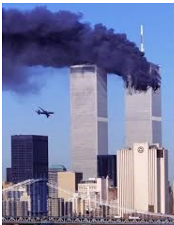
The Twin Towers

2977 American lives were lost and thousands injured when terrorists flew planes into the Twin Towers in NYC, the Pentagon and a field in Pennsylvania after passengers overtook the terrorists.