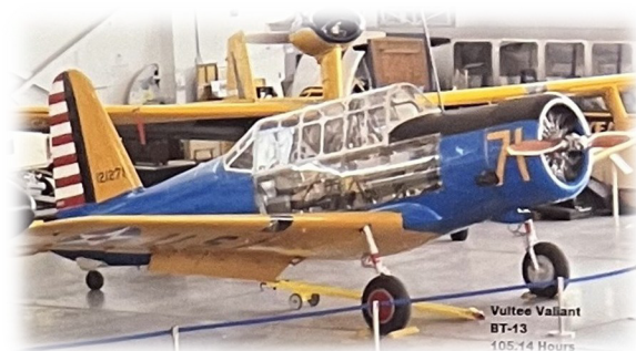
Above and below: after restoration in 2020