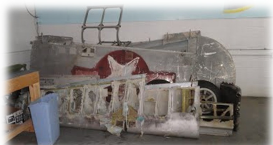
As MAPS received the B-13 Valiant in 2012

MAPS thanks The Print Shop of Canton, Inc. for sponsoring "THE BRIEFING"