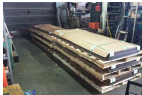
(Safety rails arriving, pictured above)