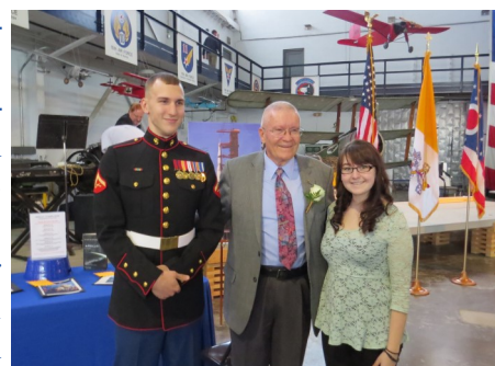
Fred Haise (center) with attendees from Yougstown. The Marine was part of the Missing Man Ceremony.

assisted in the final phase with decals and markings.