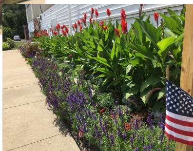
Early August Blooms