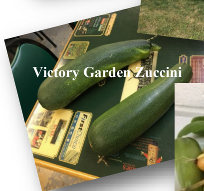
Victory Garden Zucchini