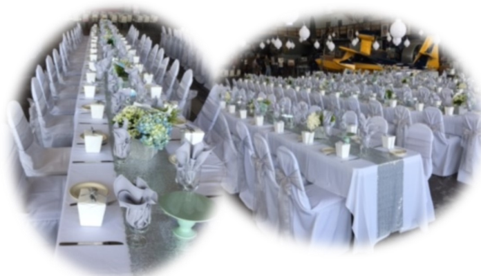
Recent wedding and reception held at MAPS