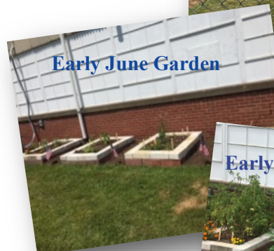
Early June Garden