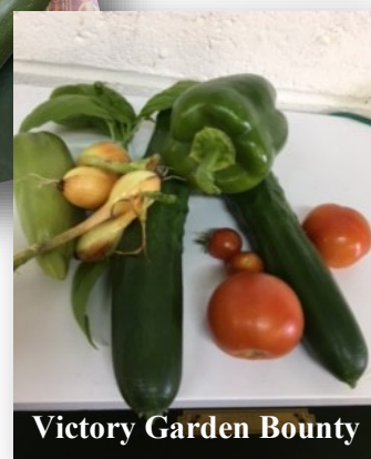
Victory Garden Bounty