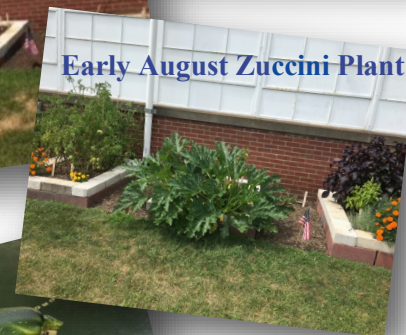
Early August Zucchini Plant