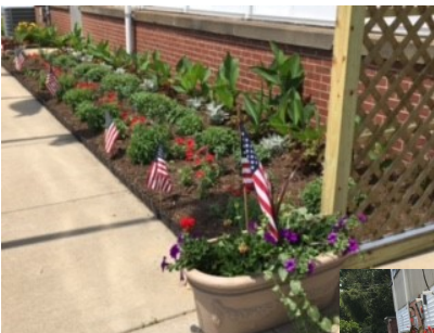
Early June Plantings